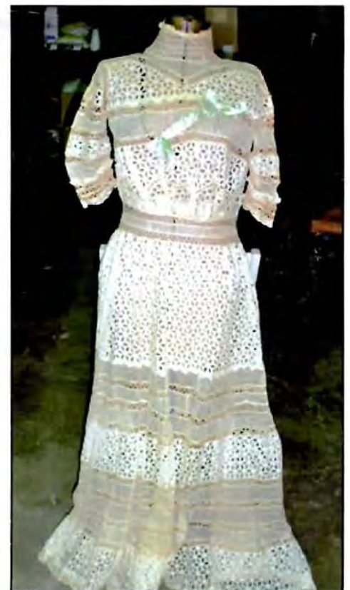
Which of the Wheeler girls wore this dress found in one of the trunks?

Recently I found a cotton eyelet lace dress with a high collar and puff sleeves from the turn of the century.