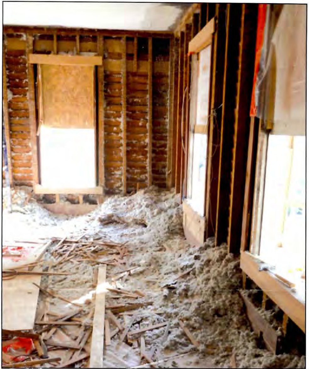
A bedroom on the second floor last month as workers stripped down to the bare walls to install new insulation and interior finishes.

Once the General's house has reopened, it will create renewed interest and bring folks to the site to see for themselves, the Southern architecture and precious artifacts that belong to the citizens of Alabama. As the site director and one of the caretakers of this heritage, I will be proud to have you all as guests.